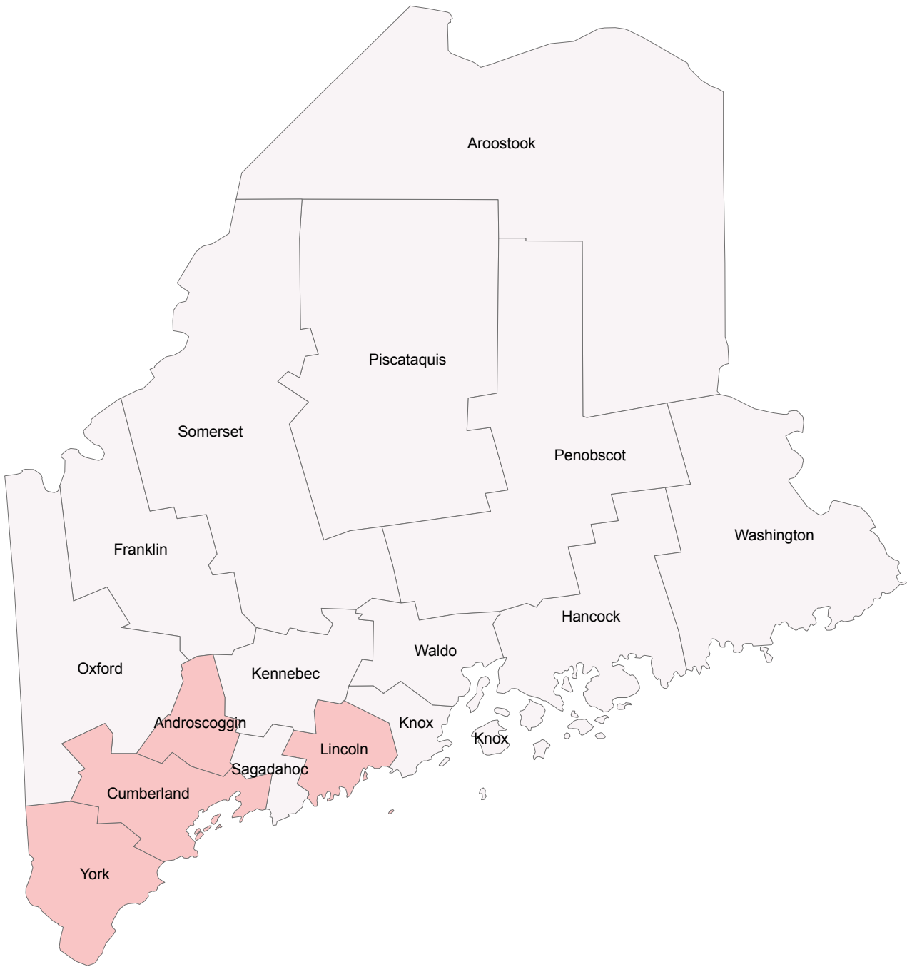
Percentage of Census Tracts with Unacceptable Data Quality